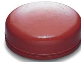
Class 7160H End Cap