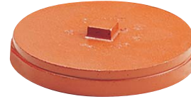
Class 7160 Blank End